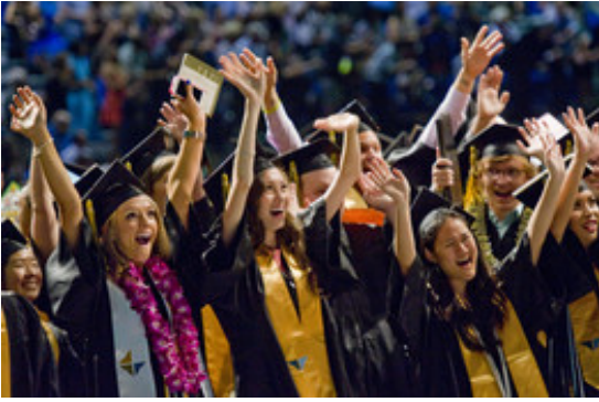
Concordia University Irvine undergraduate students get pumped up as the 2014 graduation ceremony begins in Irvine, Calif., on Saturday.